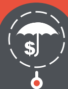
Rolling Reserve Act