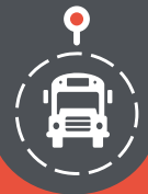
Alabama First Class Pre-K